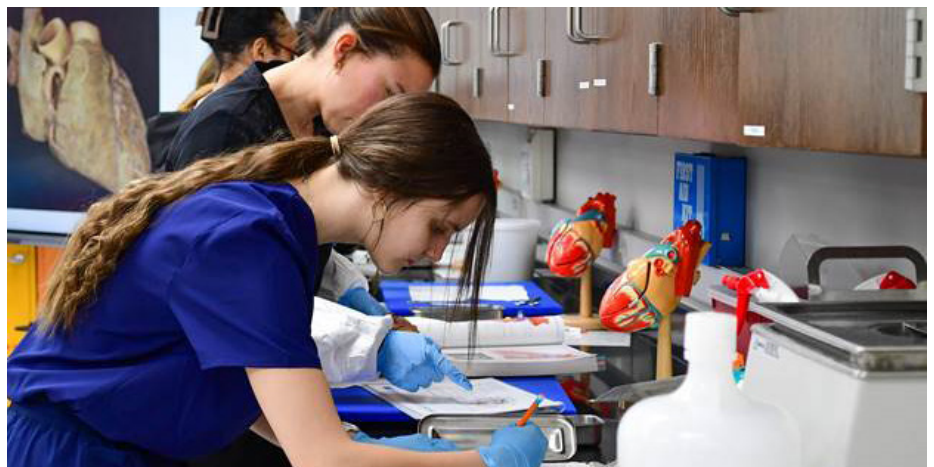
Photo: Gadsden State students participate in a hands-on learning experience in the cadaver lab

The state-of-the-art laboratory accommodates four cadavers each year giving students an in-depth perspective on the human body that is critical for understanding both normal anatomy and the impact of disease. The lab provides an immersive environment where students