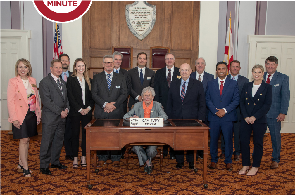
Photo: Governor Ivey signing Maritime Month proclamation with ACCS and maritime industry leaders